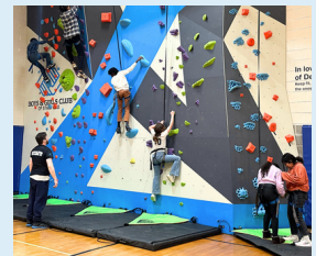
Rock Climbing Wall & Instruction