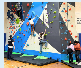
Rock Climbing Wall & Instruction