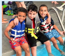
Water Safety & Swimming Lessons