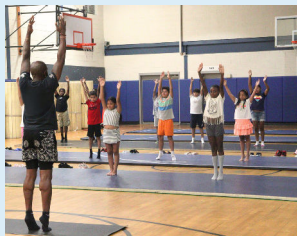
Access to Mental Healthcare