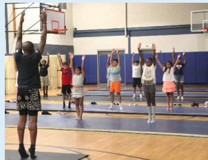
Access to Mental Healthcare