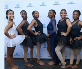
Competitive Dance Teams