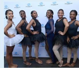
Competitive Dance Teams